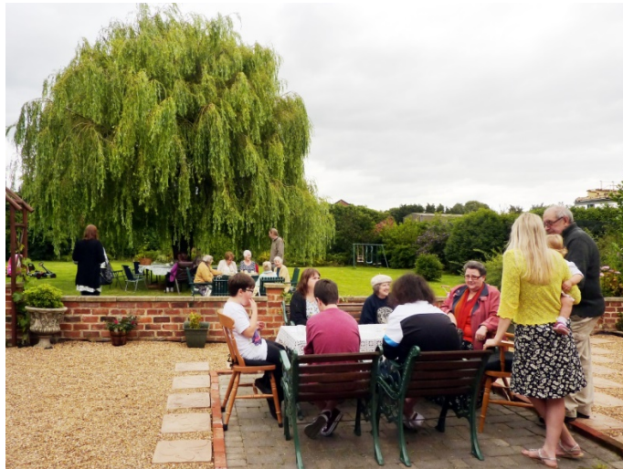
OCC Garden Party in August